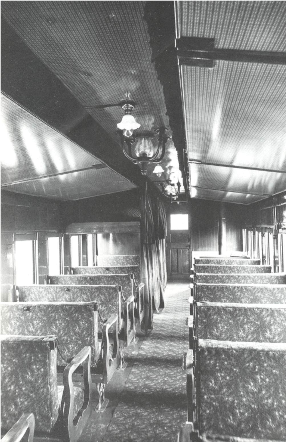
1864 Interior of Pullman's First Sleeping Car